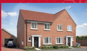
3 bedroom semi-detached homes from £299,995