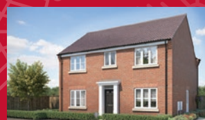
4 bedroom detached homes from £420,000

Our Marketing Suite and Show Homes are open daily, from 10am to 5pm.