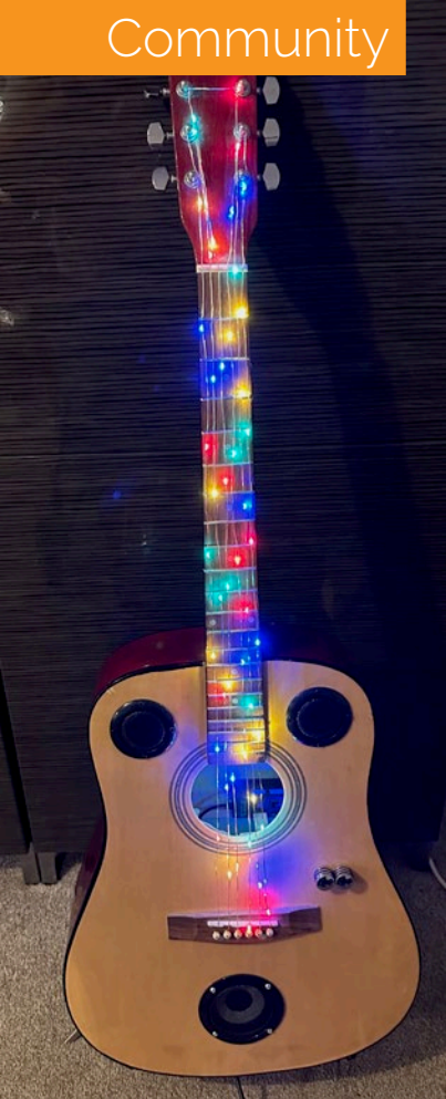
▲ Before and after: a guitar is converted into a bluetooth speaker!