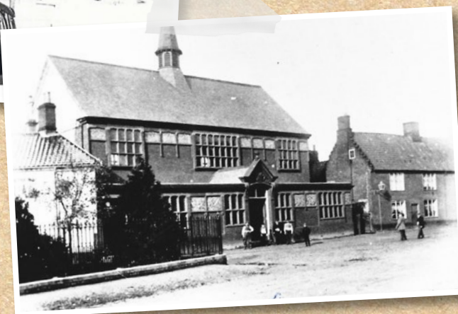
The Town Hall c.1900 ▶

More from this series at: wymondhammagazine.co.uk/whats-in-a-photo