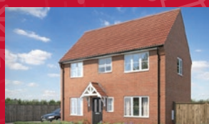
3 bedroom detached homes from £335,000