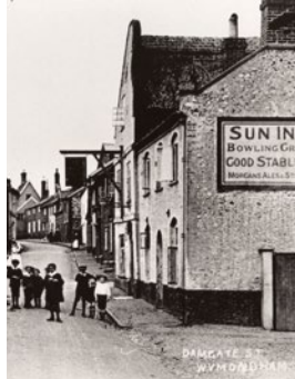
▲ Display on the lost pubs of Wymondham, including the Sun Inn, Damgate Street