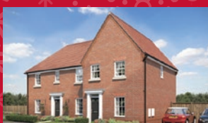
2 bedroom semi-detached homes from £255,000

Don't miss out. Visit us today and find out how we can make your new home a reality for Christmas!