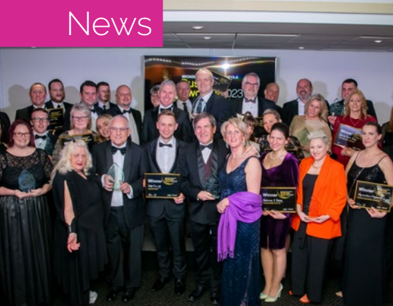
Some top local businesses have won in previous years ▼