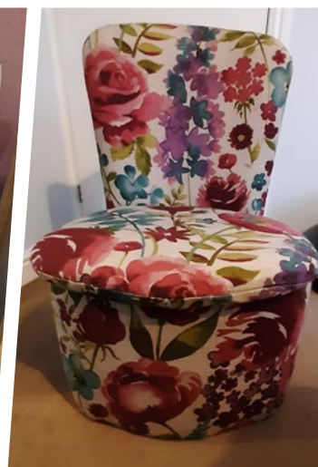
▲ Good as new! An old chair is re-upholstered using material from curtains

The Shed, 46-60 Ayton Rd, Wymondham, Norfolk NR18 0QH www.theshedwymondham.org.uk info@theshedwymondham.org.uk